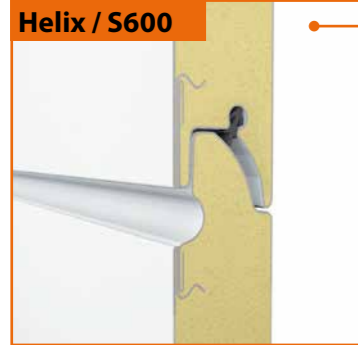
Helix / S600