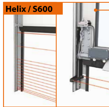
Helix / S600

The joint between the ISO and ALU sections is wind and watertight to (class 3-4 wind load)