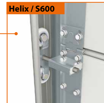
Helix / S600

The Helix Spiral Door coils itself up against the interior facade of the building and the build in space is 1100 mm x 1100 mm at the head, 550 mm on the drive side and 110 mm on the non drive side.