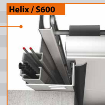
Helix / S600

For extra safety the panel connecting hinges are almost flat and ensure a perfect seal with the vertical side seals